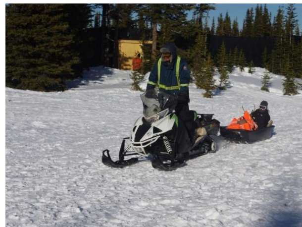
Figure 2. A captured cow being prepared for transport to the pen (left) and then relayed into the pen by snowmobile (right).