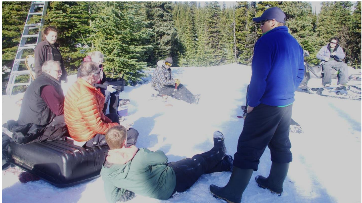
Figure 8. Discussing protocols for guarding the mat pen.