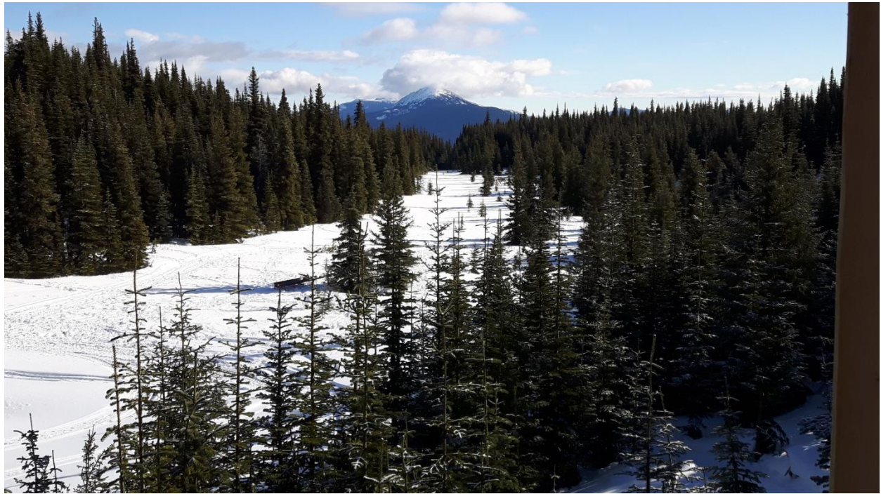
Figure 7. View of the feeding meadow from the observation tower with Battleship Mountain in the background.