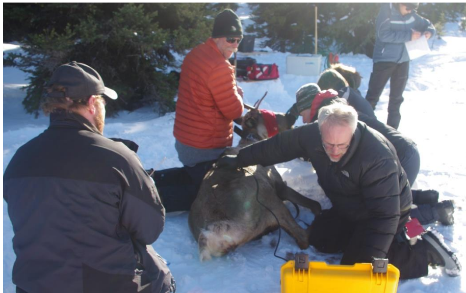
Figure 4. Taking measurements of C332K's body fat as a part of the health studies.