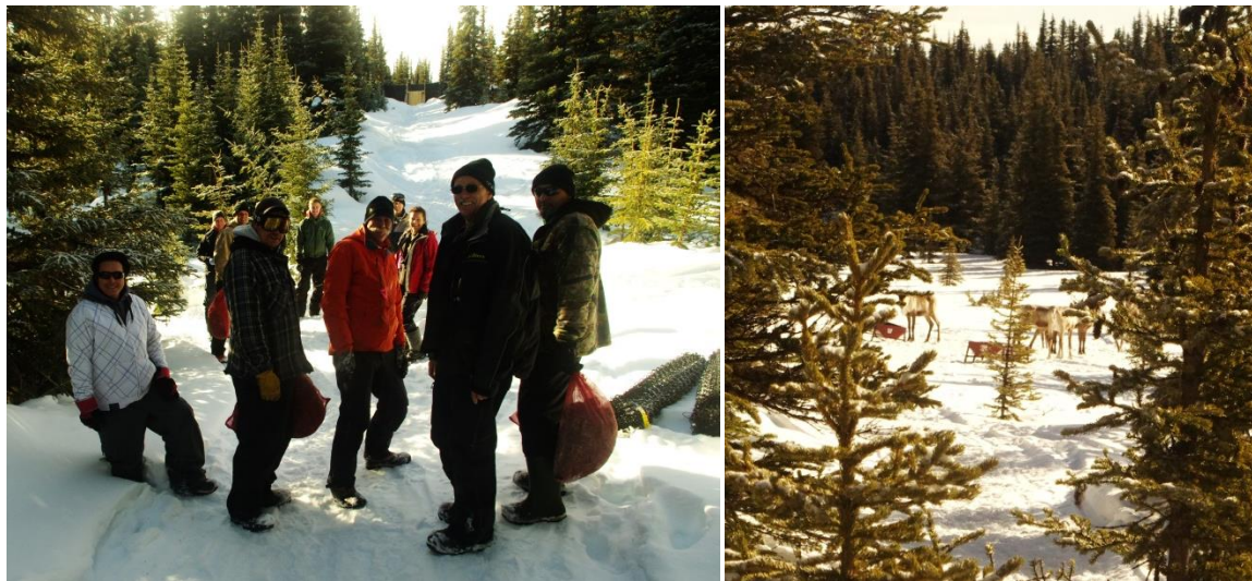
Figure 6. Some of the team going for a walk inside the pen after captures (left). On the walk, we were able to observe all 13 penned caribou feeding at the feed troughs in the feeding meadow (right).