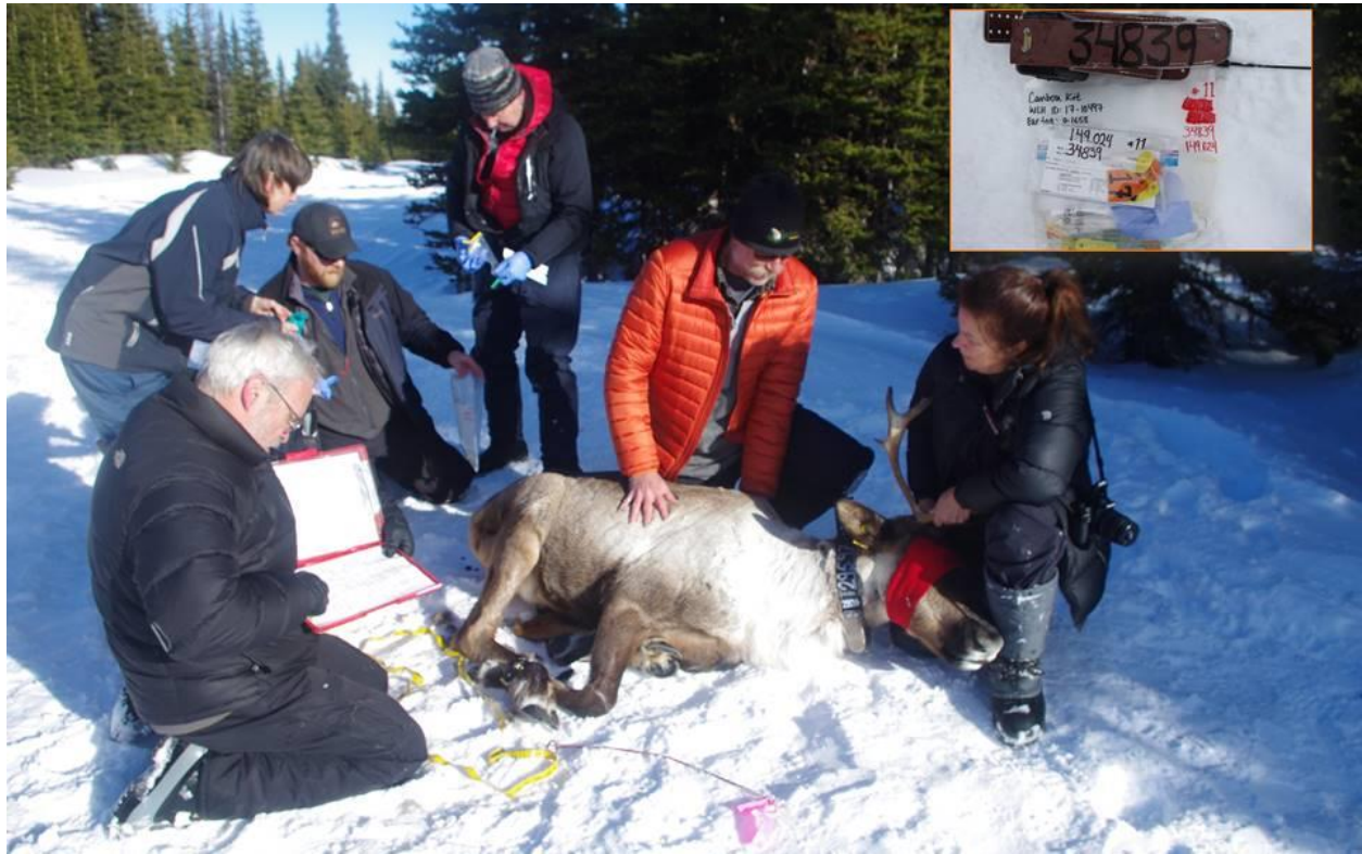
Figure 3. Caribou C332K being processed. This cow was originally caught in the Klinse-za area in 2015 and gave birth to a male calf in the 2015 mat pen that died 2 days after birth. She was recaptured in 2016 and gave birth to a female calf that survived to the following March (and is still alive today). She lived in the wild since release in 2016 but had no calf with her when recaptured this year. Inset is a picture of the collaring kit prepared for each captured caribou.