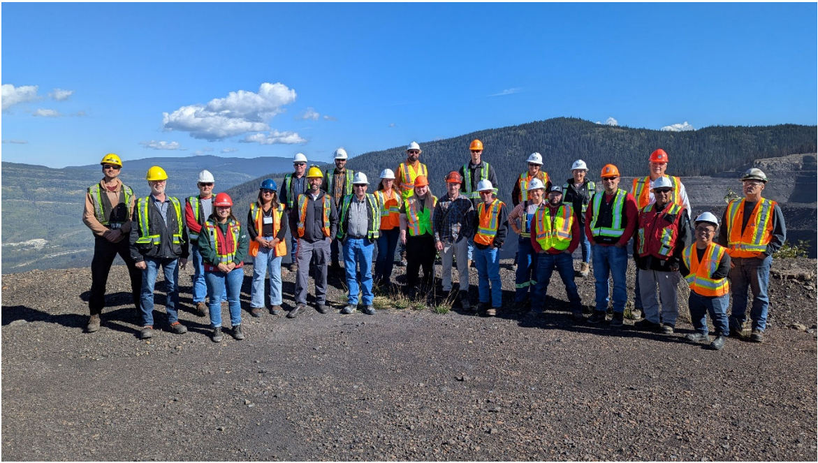
Photo 6: Willow Creek Mine restoration tour as part of the Saulteau Semi-Annual Liaison Meeting.