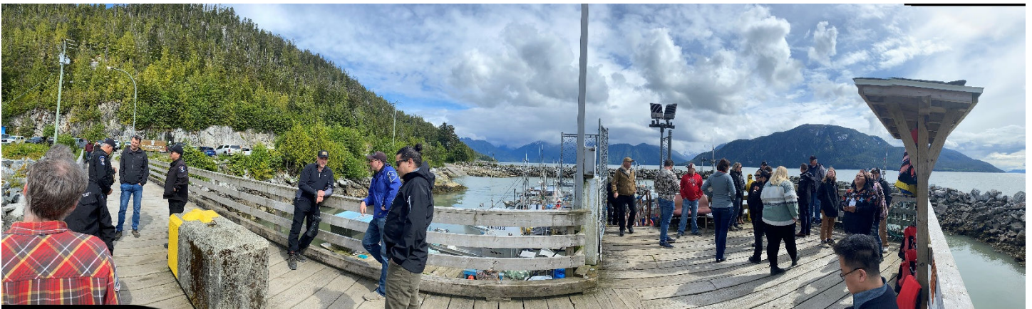
Photo 3: A group stop visiting Gingolx Village as part of cultural day for the Semi-Annual Liaison Meeting.