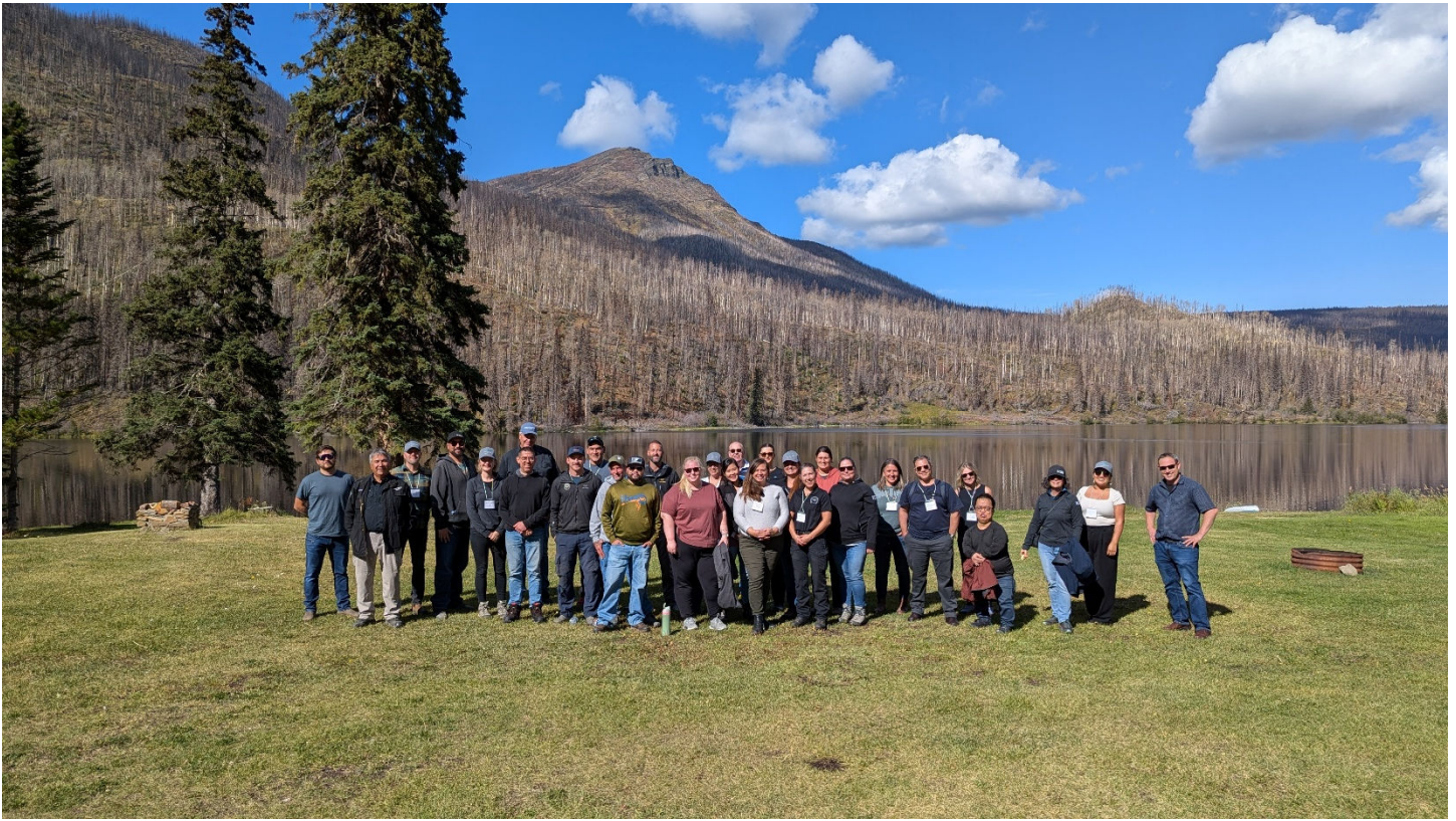
Photo 5: 2024 Fall Semi-Annual Liaison Meeting hosted by Saulteau First Nations. This photo was taken at Carbon Lake, an important cultural area for Saulteau members.