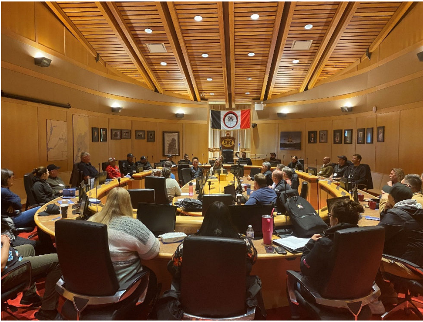
Photo 2: 2024 Spring Semi-Annual Liaison Meeting hosted by Nisga'a Nation. This photo is from presentation day in the Nisga'a Lisims Government chambers.