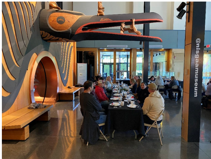
Photo 4: A traditional smoked seal soup dinner held in the Nisga'a Museum entrance.