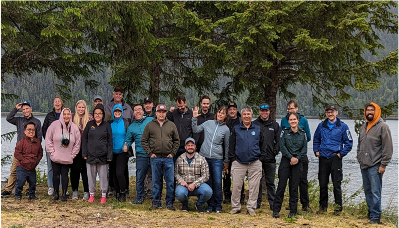
Photo 1: 2024 Spring Semi-Annual Gathering hosted by Nisga'a Nation. Attendees gathered at the Kitsault dockyard after an impressive tour of an 80's mining town lost in time.