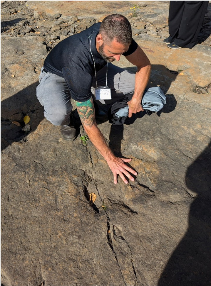
Photo 7: A visit to view the dinosaur tracks located in Saulteau First Nations territory.